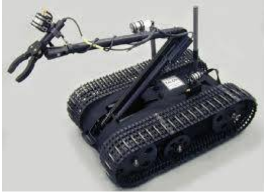
Figure 5: Mobile Robot

communication on Ethernet and develop a distributed I/O system using it as an onbody network for a humanoid robot HRP-3P. This paper is organized as follows. Section 2 explains why Ethernet is selected as an onbody network. Section 3 describes how to realize real-time communication on Ethernet. Section 4 presents a small-size controller to distribute all over the body. Section 5 explains a real time CORBA which works on realtime Ethernet. Section 6 measures the performance of a realtime communication library. Section 7 describes a distributed I/O system for HRP 3P using the real-time CORBA. Section 8 concludes the paper.