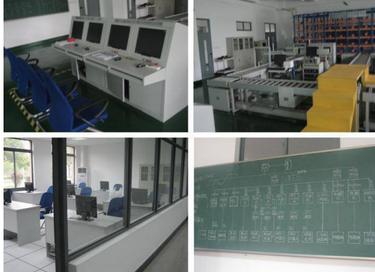
Figure 1: The first figure is the upper computers, the figure to left from back is the warehouse followed by the conveyors, third one is a view of the client computers and the fourth figure is the original sketch of the system map.